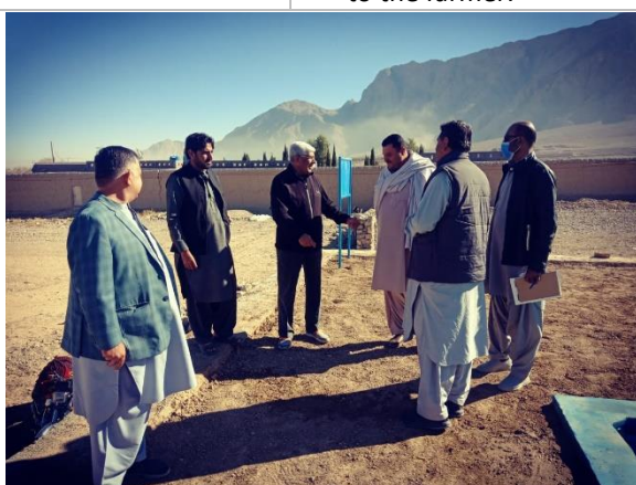
The NPC, FPMU-NPIWC-II and DG, OFWM, Balochistan n discussion with Farmer