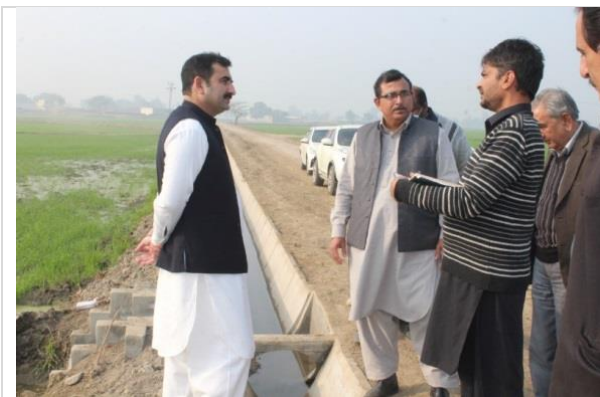
Fig. 4.2.2: D.G. Federal Water Management Cell, Enquiring about the quality of work from NWMC Field Engineer