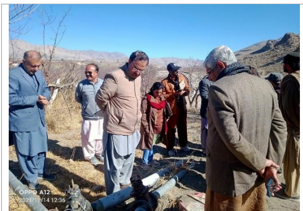
NPC with his team, ME&IE Consultants and Farmers during Field visit of WC (PVC Pipe) Saifullah, district Ziarat