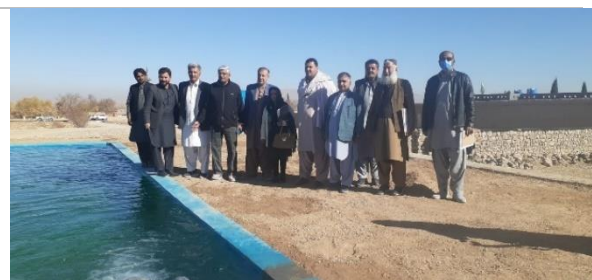
Participants of visit with NPC, FPMU-NPIWC-II and DG, OFWM, Balochistan