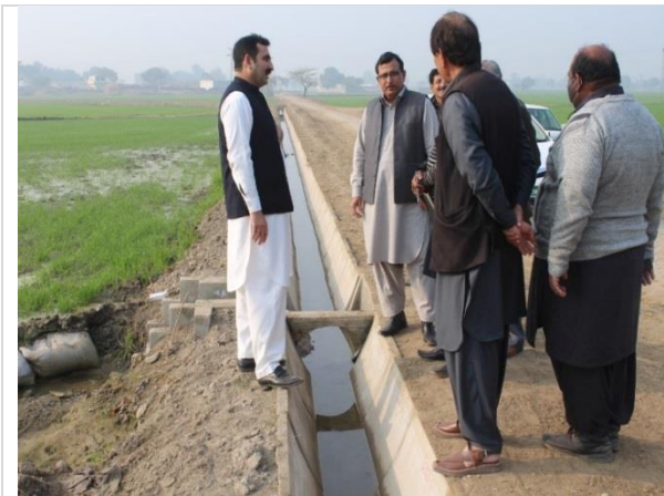
Fig. 4.2.3: DG Federal Water Management Cell Inspecting Work of Water Course Improvement

The profile of the watercourse improvement visited is given in table 4.2.2 as under: