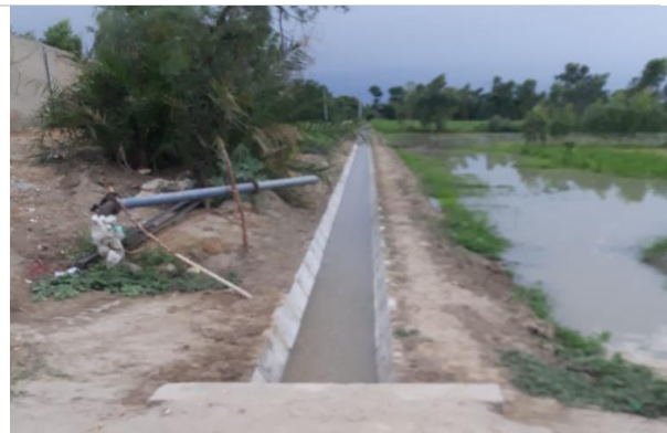
A View of Parabolic Watercourse

the head middle and tail of the water course. Land was now irrigated from 3 / 4 acres to 8 / 9 acres. The water theft issue had now been resolved.