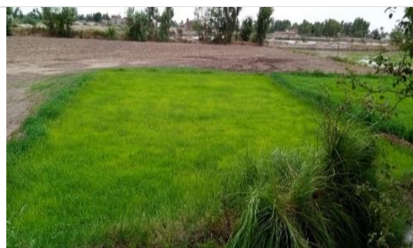
Rice Paddy Grown at the Fields