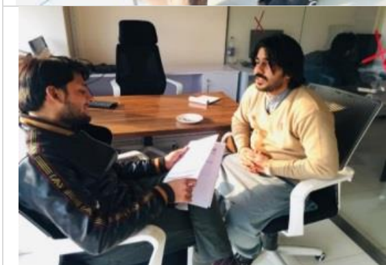
Mock Exercise by the field team members