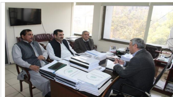
View Of Meeting held in office of Chief SPRU, Irrigation Department, Lahore