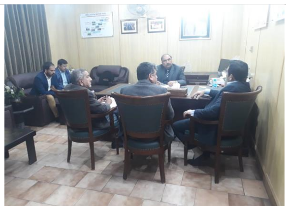
View of the Meeting held in D.G (AGRI) OFWM Lahore