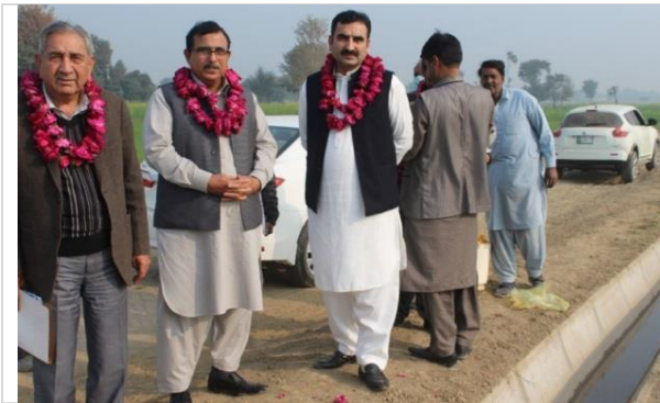
Fig. 4.2.1: D.G. Federal Water Management Cell along with others visiting the site of the watercourse