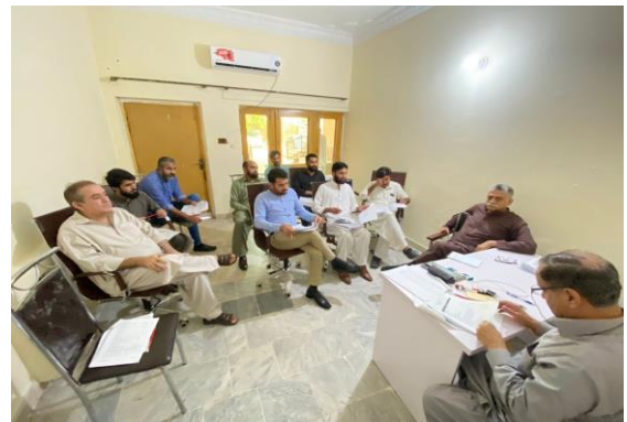
Figure-5.5: Field Team (Enumerators) in second session of Baseline Survey Training at WCBA project Peshawar Office from 8-10 September 2021.