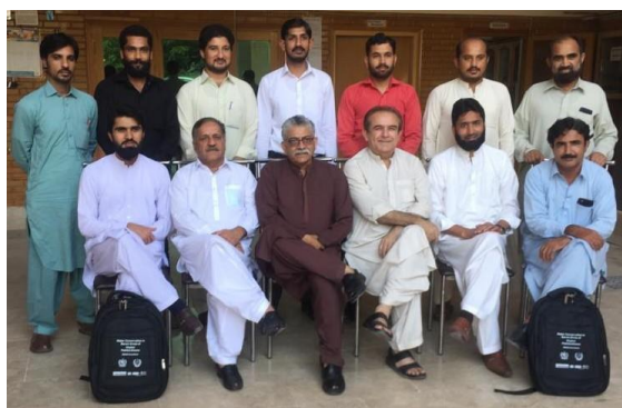
Figure-5.8: A group photo of one week field training of the enumerators along with Team Leader, Irrigation Agronomist and Social & Gender Specialist of ME&IE Consultants on 24 September, 2021