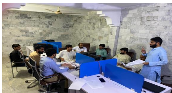
Figure-5.11: All three team members are discussing the questionnaire prior to field visit.