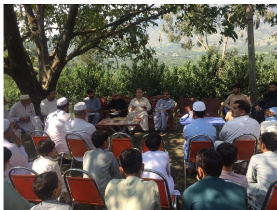
Figure-5.26: A general view of farmer’s gathering where S&WC staff, farmers and ME&IE consultants interacting.