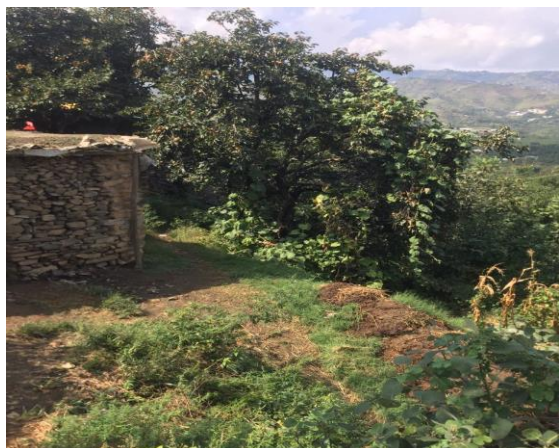
Figure-5.22: Growth and fruiting of Persimmon tree before Water Pond.

The difference between with and without interventions were very clearly observed with these farmers. The pictorial activities of the successful case study are depicted in Figures 5.22 to 5. 27. The brochure of the “Successful Story” is under preparation.