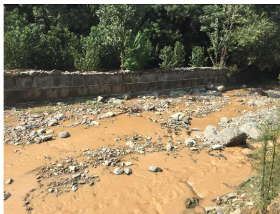
Figure-5.25: A low cost protection bund to control soil erosion and conserve water on stream.