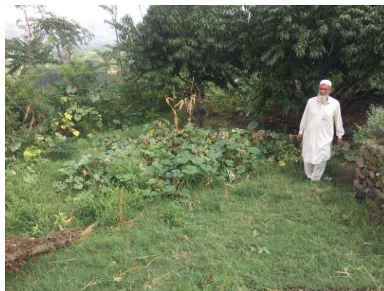
Figure-5.24: A happy farmer with home grown vegetables in his backyard after Water Pond.