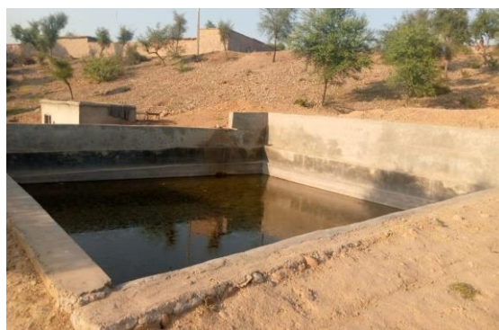
Figure- 5.20: Field Team visited Iqbal Hussain, Churakh Garhi chandan , Peshawar, 16 September 2021.