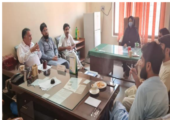
Figure-5.9: Members of field team in meeting with Mr. Yaseen Wazir DG, Soil & Water Conservation, KP prior to moving in the field on 14 September 2021.

Field Team of WC-KP has been mobilized and members of these team visited client office and activity areas to collect basic info regarding baseline survey and monitoring evaluation data in Peshawar area in the Central Zone. Pictures in the field area of field team movement and water conservation activities are presented at Figure 5.9 to 5.20.