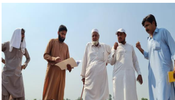
Figure-5.14: Field Team # 1 & 2 visited Aqal Muhammad Protection Band Garhi Faizullah, Chowk Shams Kheil Kas Peshawar, 16 September, 2021.