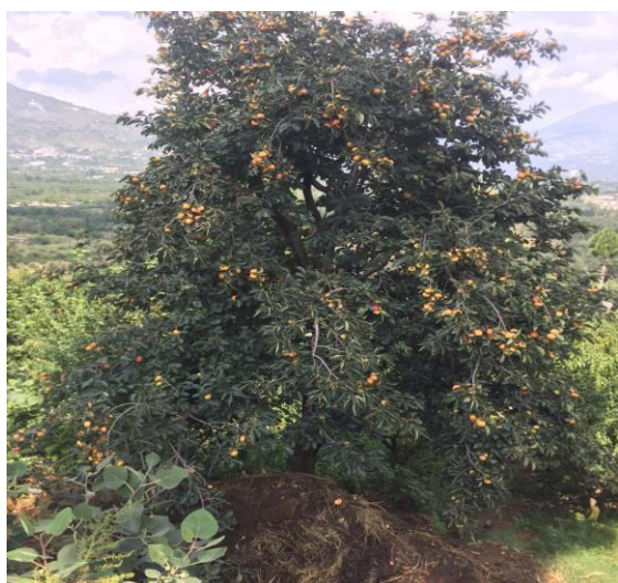
Figure-5.23: Growth and improved quantity & quality fruiting of Persimmon tree after Water Pond.